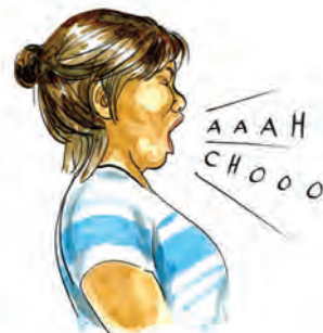
Coughing or sneezing