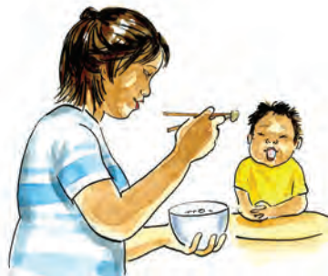
Sharing plates and cutlery