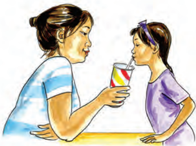
Sharing food and drinks