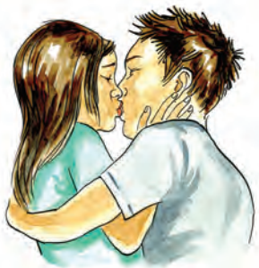
Touching or kissing